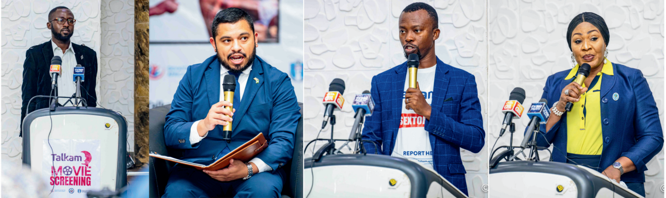
Abuja – Sextortion Training for Teachers & Student