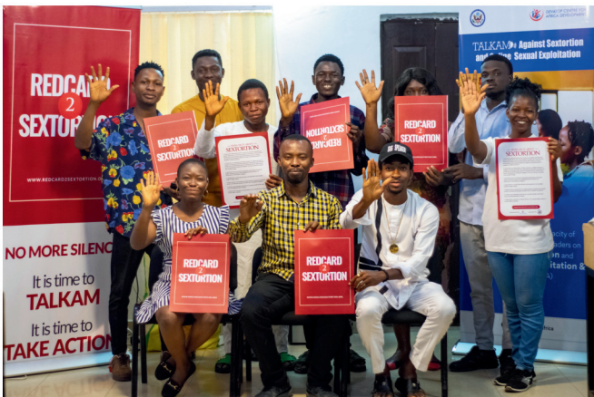
Nasarawa – Sextortion Training for Teachers & Student