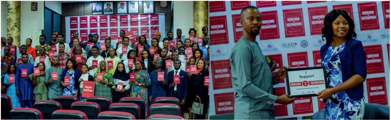
Sextortion & Revenge Porn Movie Screening